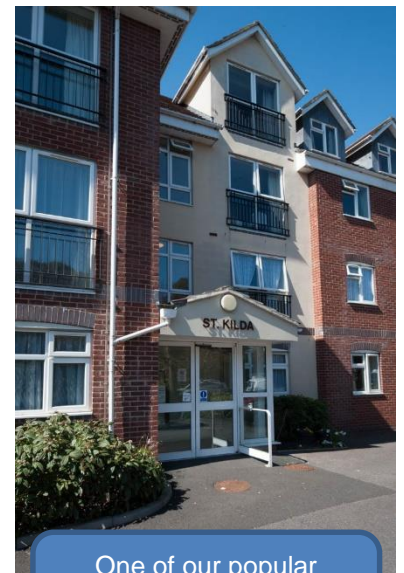
One of our popular Stourwood Avenue 60+ blocks of flats

We have no immediate plans to close our waiting lists but thought it would be helpful for you to know the current situation.